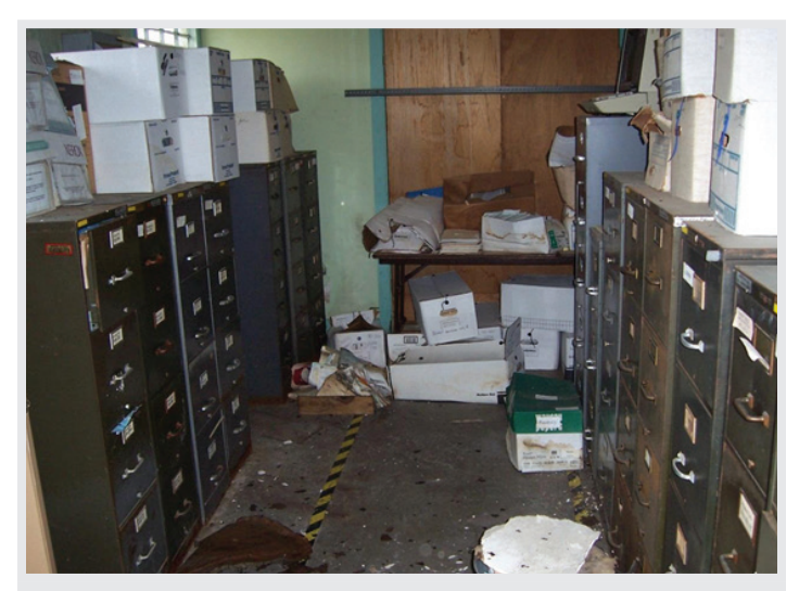
Figure 1. Physical damage to files demonstrates the need for electronic records

During Phase 2, Texas A&M AgriLife automated processing of documents from legacy mainframe systems directly into the Laserfiche ECM for accounts payable, purchase orders, and payroll change forms. A hurricane in 2009, the collapse of a storage building roof as a result of storm damage in 2010, and a fire in 2011 that resulted in smoke and water damage to multiple documents (see figure 1) added urgency to digitizing records and having off-site backup storage. Currently, Texas A&M AgriLife electronically stores close to 14 million document pages.